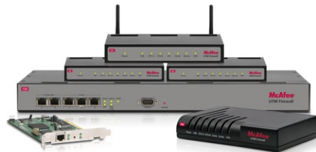
Figure 1: Enterprise-class security solutions tailored for the distributed environment and the small and medium-size enterprise.

:E R_U dVTF cZj` dRVM RaadVTReV F E>` ZVh R]]d Wc eYVZ` VRj` ^ R_RXV^ V_e` Wb` ]ZVdR_U f aURv dL R_U eYVZ` T` ^ adYV_dZjV` ^` _Z`_cZ_X R_U dVa` cZ_X TRaRSZ_ZVdZ`4` ^ a]R_TV` _WTVdL gR]f V eYVdV Raa]R_TVd Wc eYVZ`_RSZ` e` ac` gZUV eYV`_Z_Wc` ReZ` _eYV` _WU e` ^ WedXf ]Re`_g` dVbf ZV^ V`_ed R_U dZ` a]ZV Rf UZcZ`